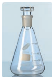
Flasks, Iodine Determination with Glass Stopper, Made from Heat Resistant, Low Expansion Borosilicate Glass, RIVIERA