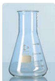
Flasks, Erlenmeyer, Conical, Wide Mouth, with Graduation, DURAN DIN 12385